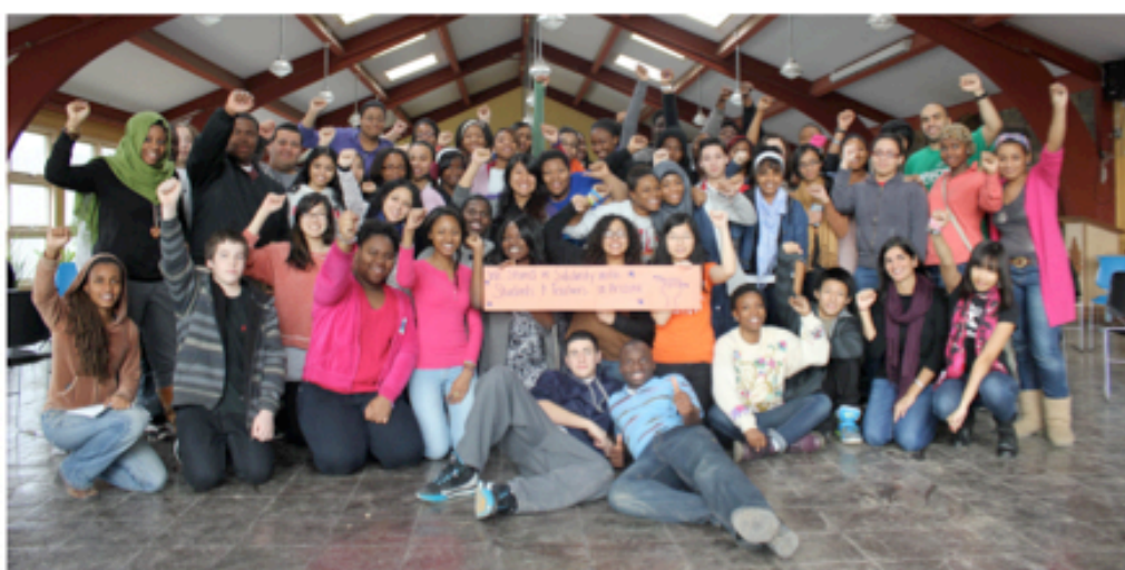
Global Kids Youth Stand in Solidarity with Students and Teachers in Tucson, Arizona

In February, sixty GK students from across NYC went on a three-day retreat to upstate NY. They took part in workshops on topics such as democratic participation, health, and ethnic studies, and practiced their facilitation skills in preparation for our upcoming youth conference. After learning about the struggle to defend "Raza Studies" in Tucson, Arizona, students wrote letters and took photos to show their support for students in Arizona who fought for their right to an empowering and culturally relevant education.